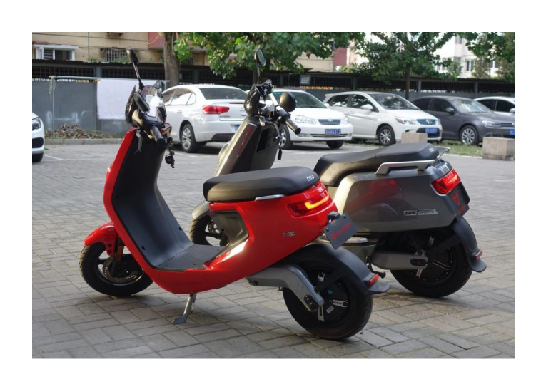
Electric bicycle without pedal